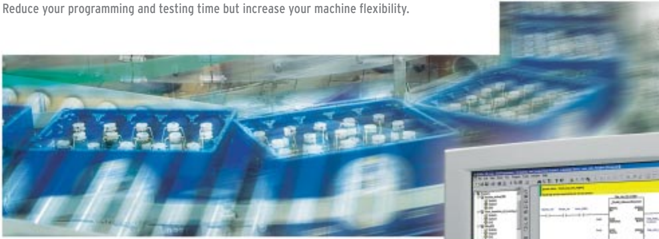
Advanced Industrial Automation

Reduce your programming and testing time but increase your machine flexibility.